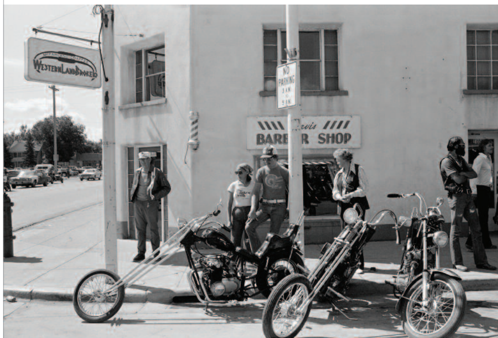
"Choppers at Junction and Main"